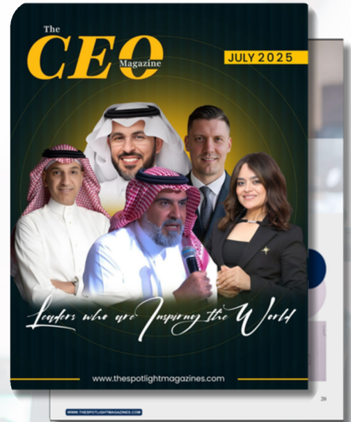
Annual Publishing of The CEO Magazine