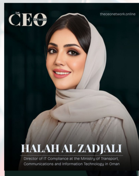
Daily Publishing of Social Media Posts across multiple platforms