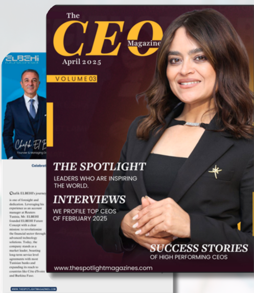
Monthly Publishing of The CEO Magazine