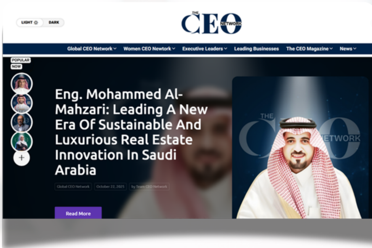
Blog Posting and Featuring on Website across different exclusive categories

We recognize excellence across multiple channels across social media and web